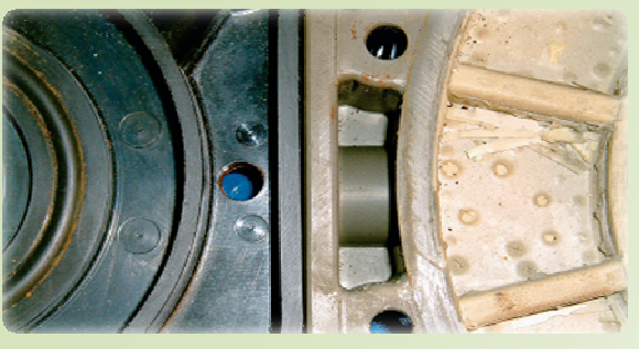
A Chloraflon body near an ABS body, after 10 year of contact with chlorine gas. Chloraflon has not been damaged whereas ABS was.